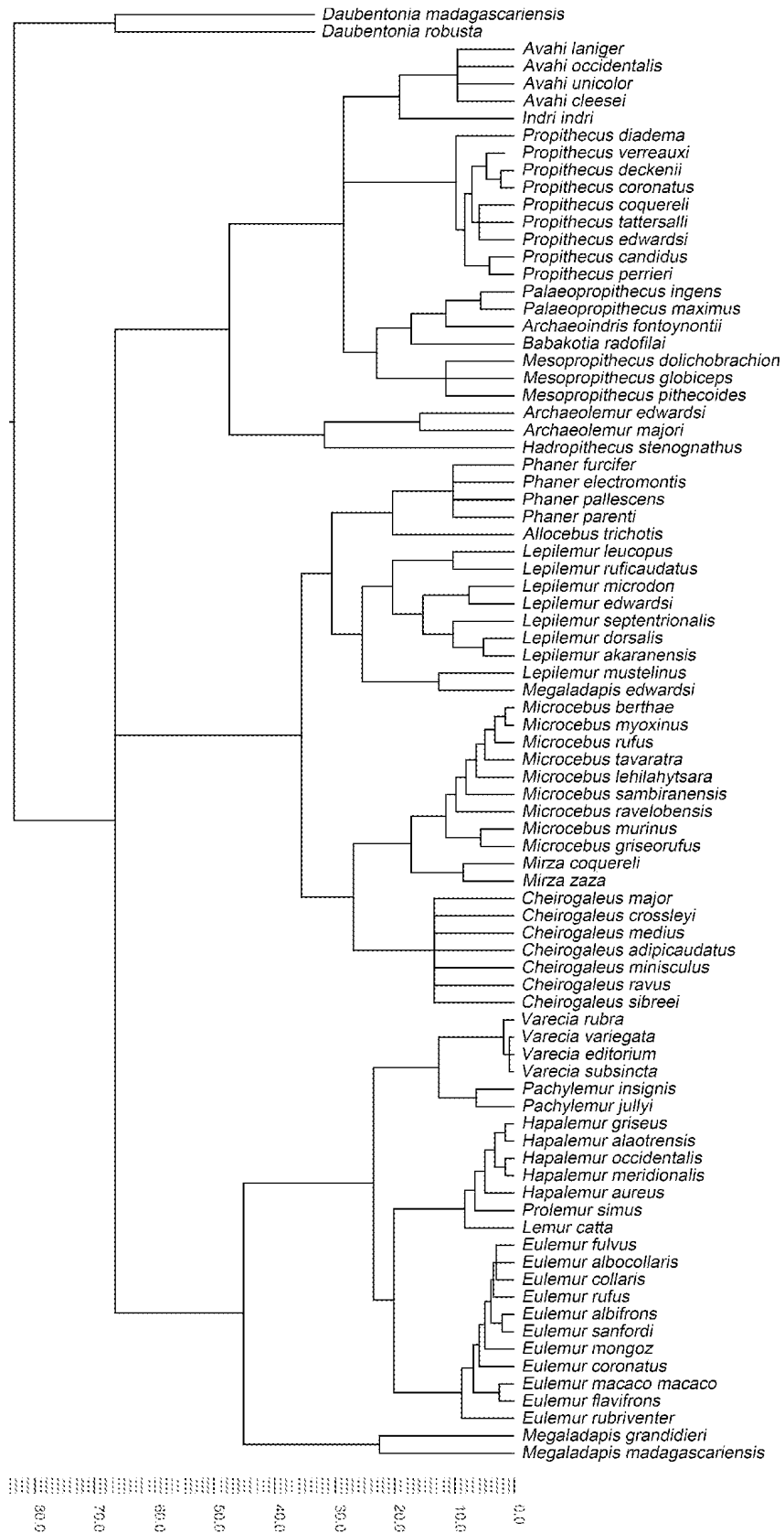
Figure 2. Phylogenetic tree of Malagasy primates reconstructed from Horvath et al. (2008). Scale used: million years.

phylogenetic distance (MPD) between all species pairs in a community ( MPD_{\text{sample}} ) relative to the mean phylogenetic distance of all taxa in a null community ( MPD_{\text{rndsample}} ),